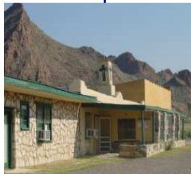
Big Bend Baptist Church in Terlingua

All of these ministries share Grace of Giving's purposes, which are to show God's love and to spread the good news of the gospel of Jesus Christ by helping to meet people's daily needs.