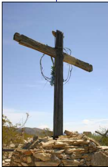
This is why we serve!

How God wants this done and what else He has in store for us during 2007, only He knows. If God puts it on your heart to assist Grace of Giving financially, we will be most appreciative. Most of all, we request your frequent and earnest prayers on our behalf that we would honor God in all we do, and that we would travel safely during 2007.