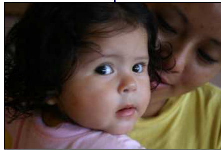
This is a precious example of who we serve!

It would be a blessing for Grace of Giving to obtain a license to import goods into Mexico, because we could then assist our ministry friends all along the border. We are taking initial steps to obtain advice as to how we might best proceed in these circumstances.