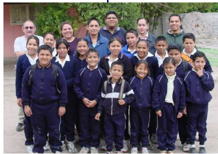
The children and staff at Casa Hogar Galilea in Monclova, Coah., Mexico