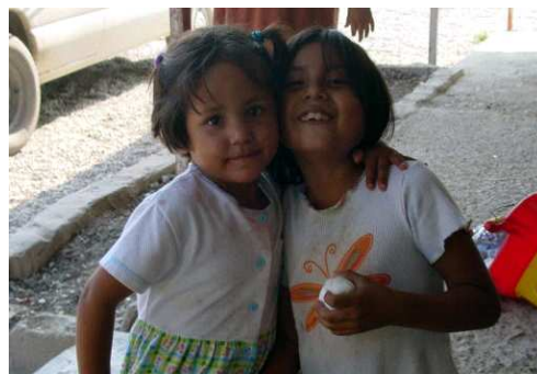
Two young girls cared for by the dedicated servants at Casa Hogar Nuevo Fuente de Vida in Acuña/Jimenez, Coah., Mexico