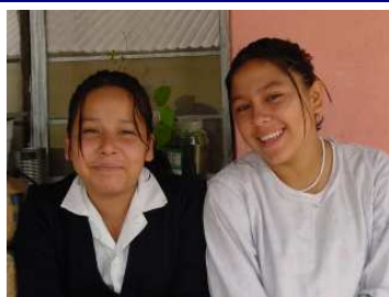
Two of the young ladies who live at Casa Hogar Galilea in Monclova, Coah., Mexico