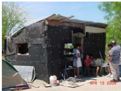
The "new" house

With her husband no longer present to lead this family, she and her children have been living in a very small tar paper, cardboard and wood shack near her mother's house. The government has recently given her a small piece of property that she can call her own, and she has proudly built a new house on that property.