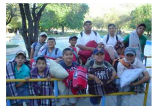
The "guys" from Casa Hogar Galilea in Monclova on their way to camp!

We wish to confirm to you that 100% of the expenditures from Grace of Giving funds during this time period went to purchase bulk food items (beans, rice, masa, etc.), canned goods and cooking oil.