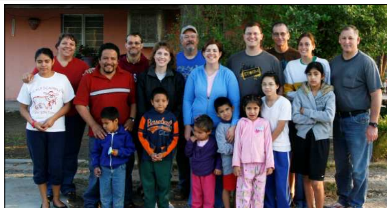
The interior work was done by this crew from FBC Burluson and FBC Clifton - pictured with some of the kids from Casa Hogar Galilea, where the two groups stayed