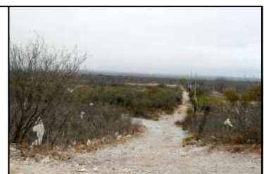
The Amaya's "picturesque" back yard - how blessed we are by where we live!