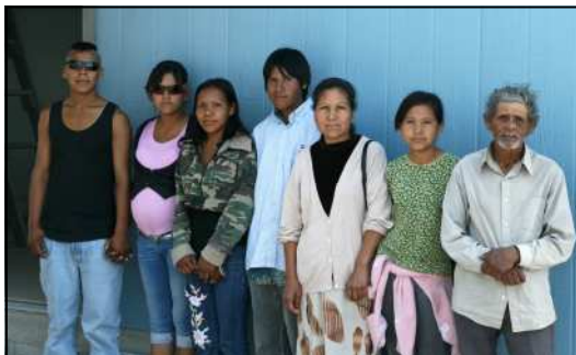
The Amaya family - not shown are two smaller sons who currently live at Casa Hogar Galilea