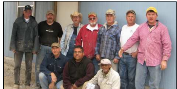
This crew from Mt. Olive Baptist Church in Guy, Arkansas, did the exterior work on the Amaya house