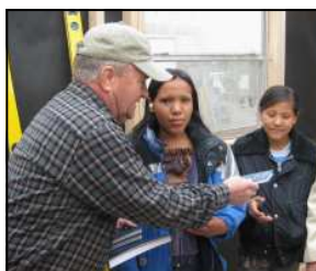
Gideons with the Mt. Olive crew stayed busy distributing Spanish New Testaments