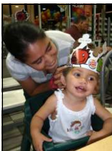
A highlight of the week - taking the Casa Hogar Galilea kids to Burger King!