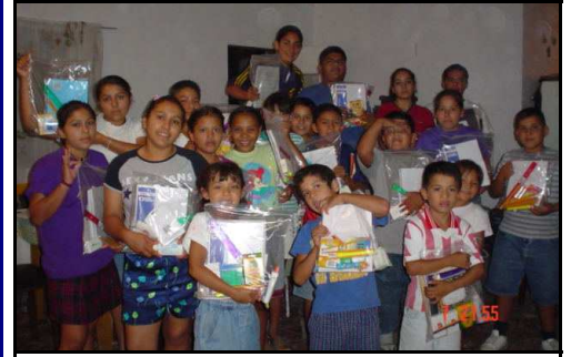
The children at Casa Hogar Galilea posing with their new school supplies last August.

We are honored to be able to serve others in God's name as well as in the name of these precious loved ones.